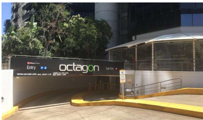
Image: Wilson carpark entrance under the Octagon building.

You may also be able to find parking on surrounding streets. These areas may be timed and monitored by Parramatta Council.