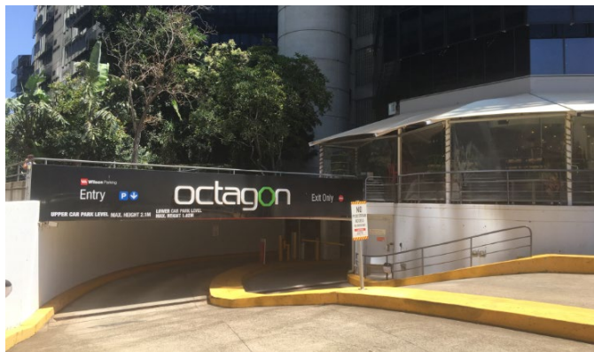
Image: Wilson carpark entrance under the Octagon building

There are also three more multi-level carparks located a short walking distance away from the Cameron Centre.