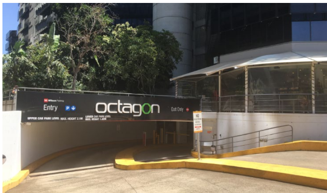
Image: Wilson carpark entrance under Octagon building

There are also three more multi-level carparks located a short walking distance away from The Cameron Centre.