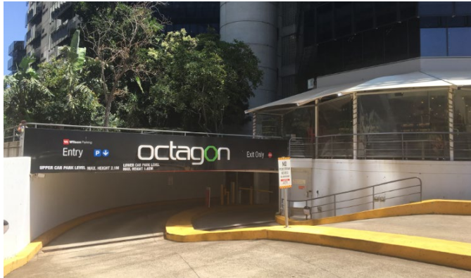
Image: Wilson carpark entrance under Octagon building

There are also three more multi-level carparks located a short walking distance away from The Cameron Centre.